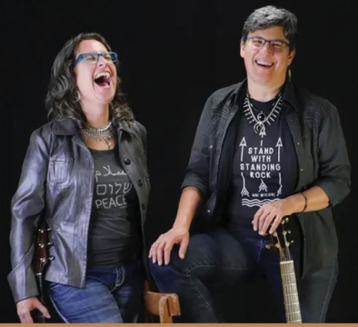
Visit Us in the Exhibit Hall UUWF: #105 Emma's Revolution: #509

featuring live music by Emma's Revolution with their fabulous Bay Area band