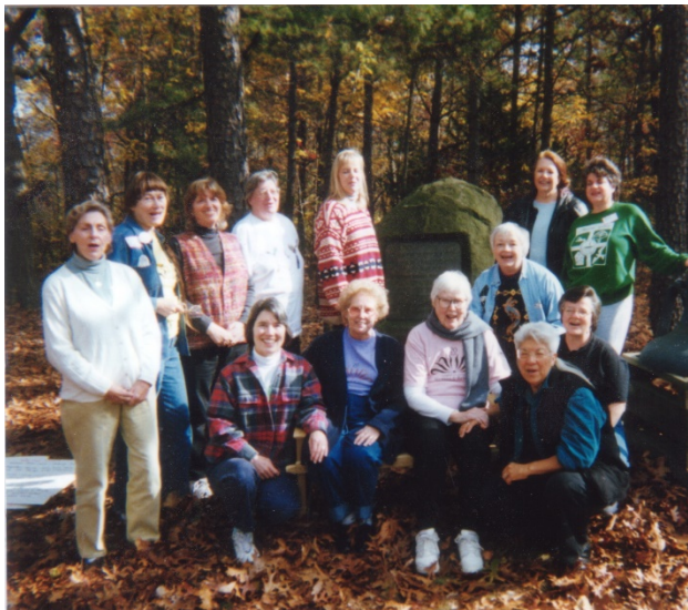
W&R Conveners Annual Gathering 1999, held in Murray Grove, NJ and hosted by Metro NY and Joseph Priestley W&R